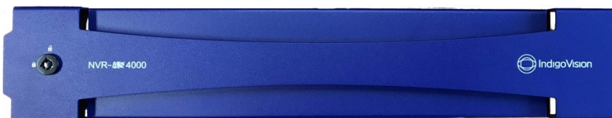
Figure 3: Enterprise NVR-AS 4000 2U/G3

The Enterprise NVR-AS 4000 G3 2U variant has three configurations, defined by base video storage capacity. In all three configurations, storage is divided between a RAID1 array which is used to store OS and configuration data and a RAID6 array which is used to store recorded video. Each configuration only differs by the location and type of the physical disks included in these arrays.