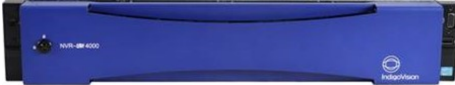
Figure 2: Enterprise NVR-AS 4000 2U

The Enterprise NVR-AS 4000 2U variant has 12 hot-swappable hard-disk bays, accessible from the front of the device. The disks in these bays are configured as a RAID6 array. This array is used for video storage.